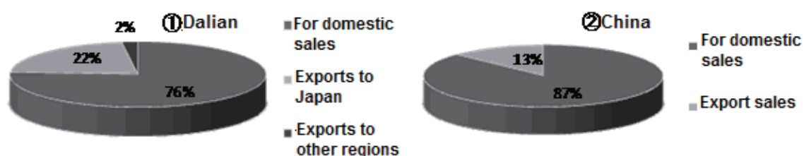
Figure 1: Breakdown of markets for the software and information services industries of Dalian and China, 2009